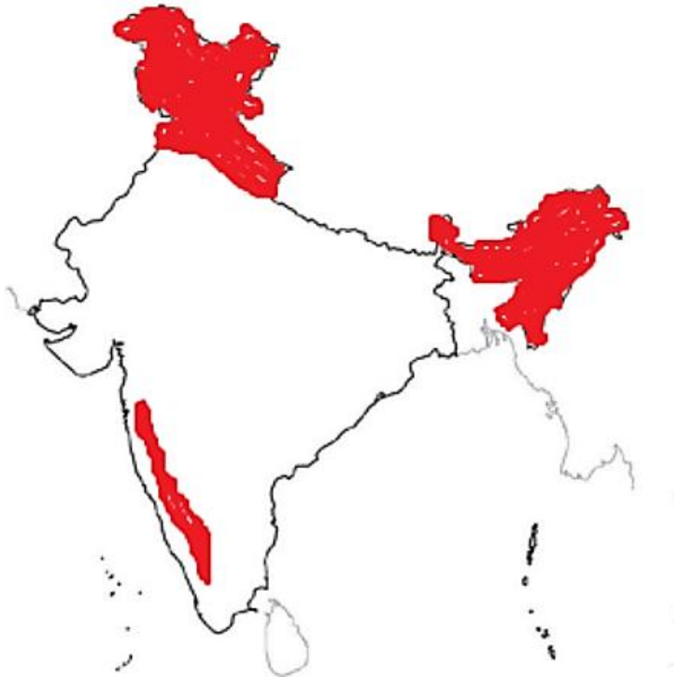
Areas under Hill Area Development Program